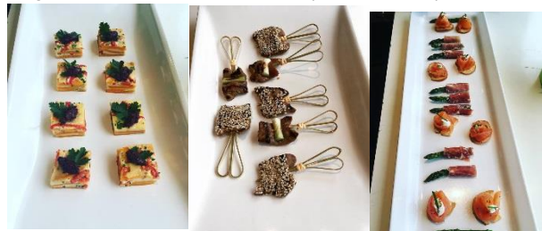
All prices exclusive of VAT

Belgian Chocolate Strawberries (2 per person)